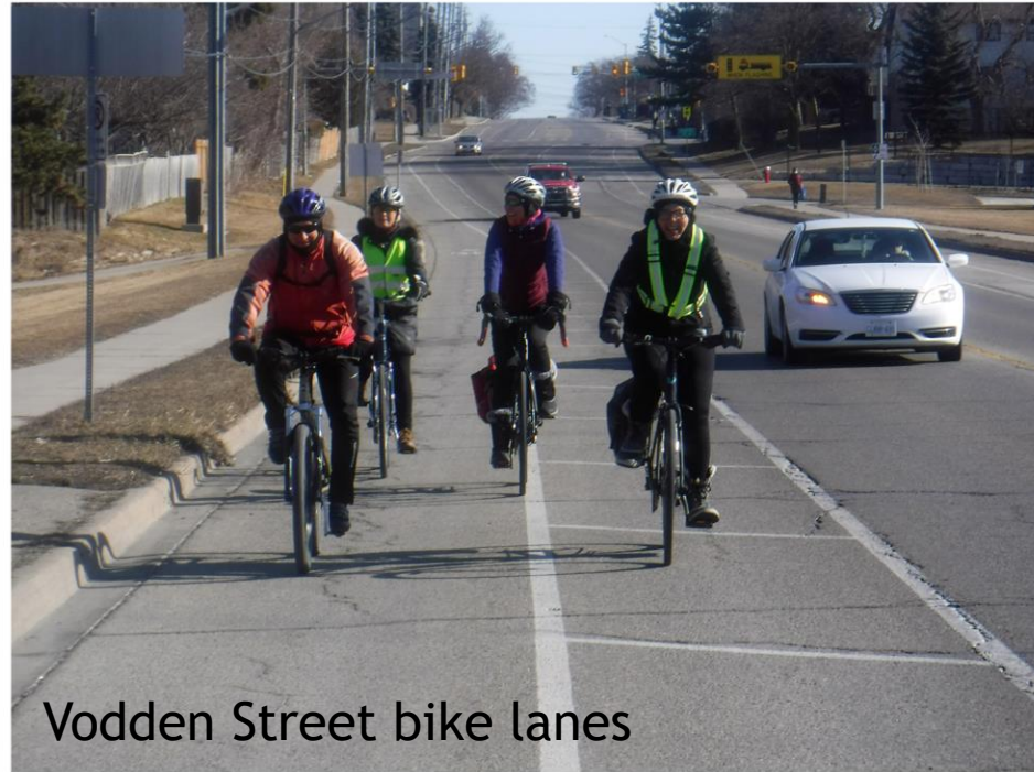
Vodden Street bike lanes