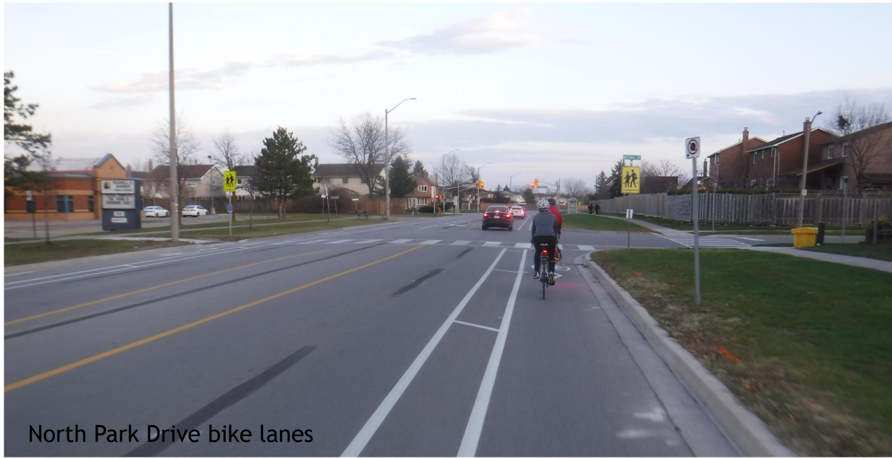
North Park Drive bike lanes