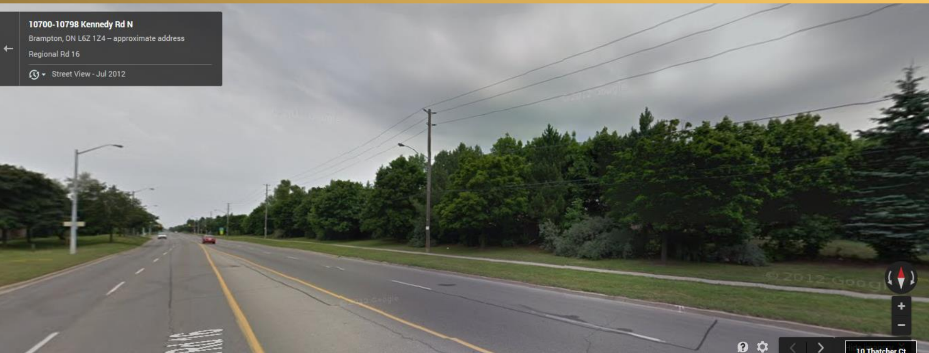
Kennedy Road N., Google Maps 2014