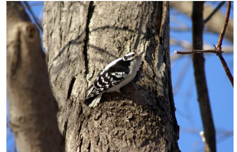
Downy Woodpecker in Stafford Woods, beside Etobicoke Creek