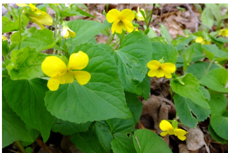
Downy Yellow Violets, Stafford Woods