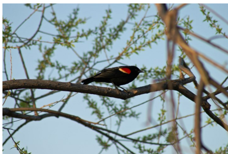
Male Redwing Blackbird in Conservation Drive Park wetland beside Etobicoke Creek