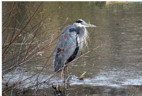
Great Blue Heron fishing in Etobicoke Creek