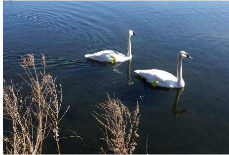
Trumpeter Swans on Loafers Lake

sign up for our free event to visit the trail on June 21st so you can spot some birds too!