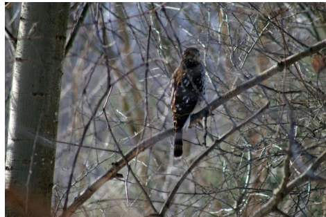
Coopers Hawk surveying Etobicoke Creek valley