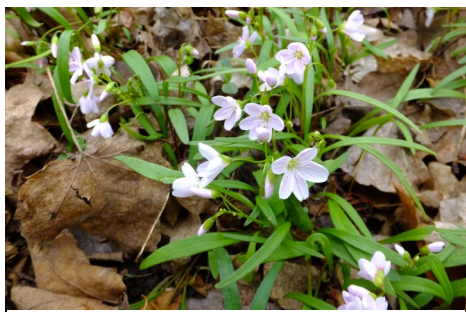
Narrow-Leaved Spring Beauty, Stafford Woods