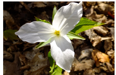
White Trillium, Stafford Woods