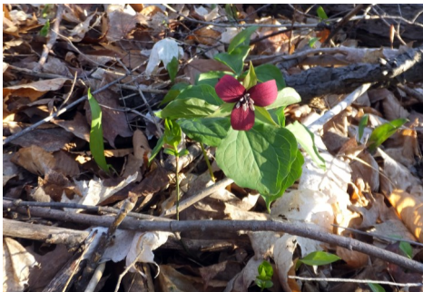
Red Trillium, Stafford Woods