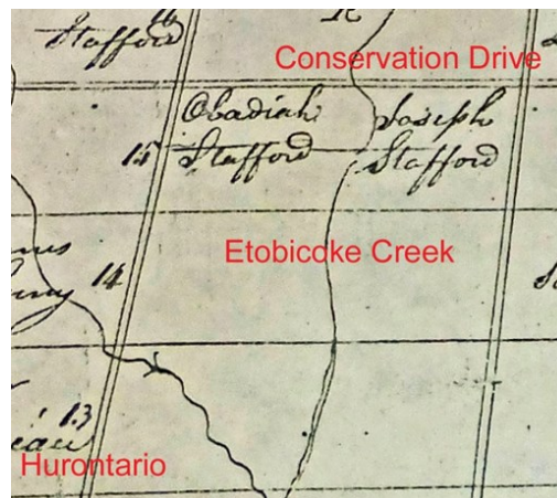
Detail of Bristol Survey of 1835

The trail through the woods will be part of our Bike the Creek route on June 21st.