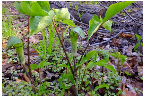
Jack in the Pulpits, Stafford Woods