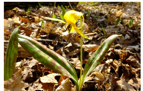
Trout Lily, Stafford Woods