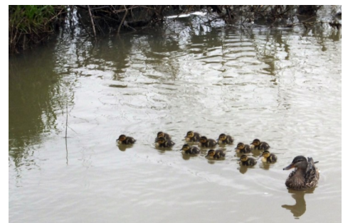
Female Mallard with her 12 ducklings navigating the current in the Etobicoke Creek