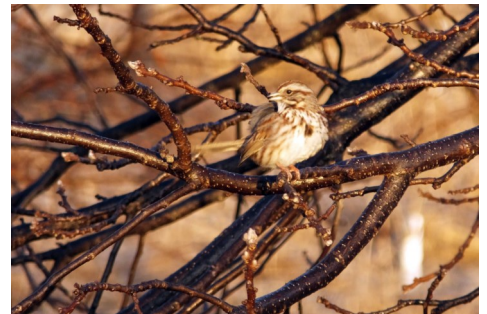
Song Sparrow delighting the morning with music along Etobicoke Creek